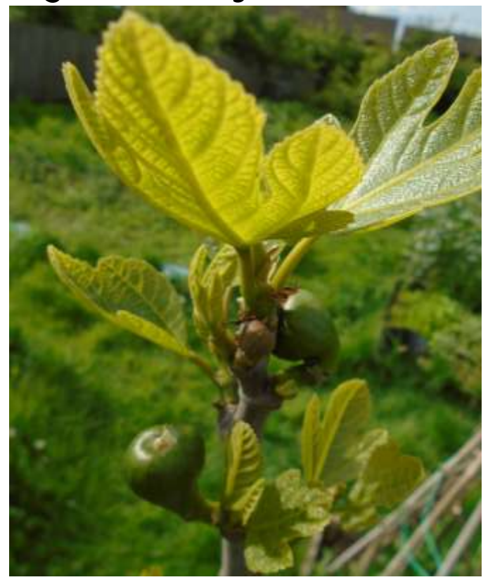
Fig tree has fruit.....