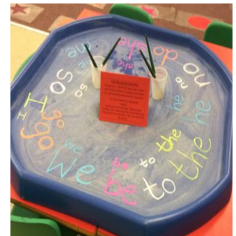
Mark Making Area