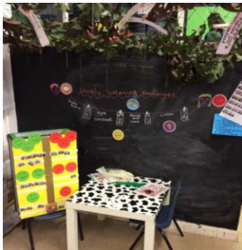
Lovely listening Area