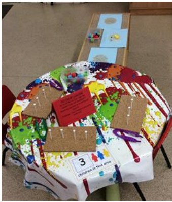
Our finger gym