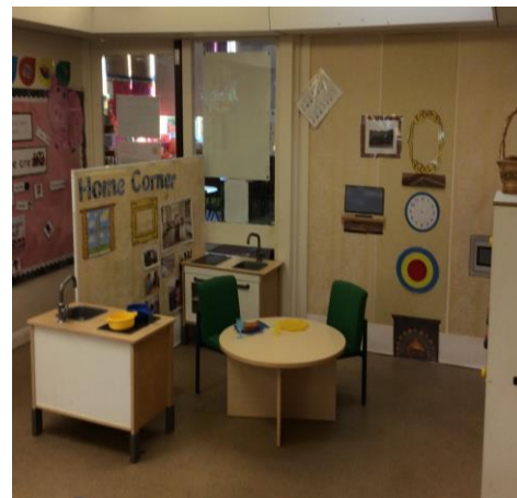
Our home corner