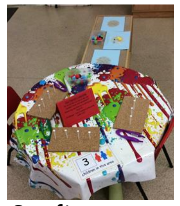
Our finger gym

Our environment consists of several areas, which provide opportunities for both inside and outside learning. Each area provides different learning experiences and challenges for the children to access.