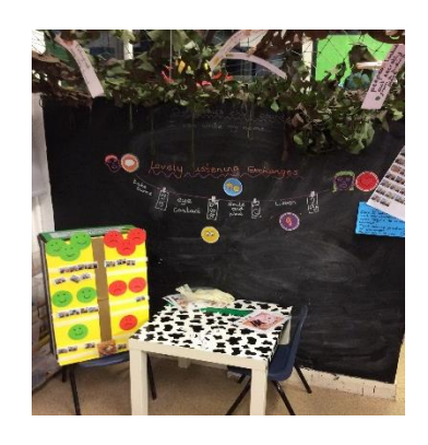
Lovely listening A rea